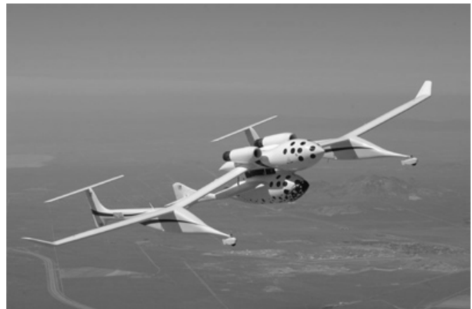
Figure 5 – The White Knight turbojet aircraft with Space Ship One attached to its underbelly. On October 4 th 2004, it won the $10 million Ansari X Prize. The competition challenged independent designers to safely put three people into space twice in two weeks with a reusable spacecraft [24].