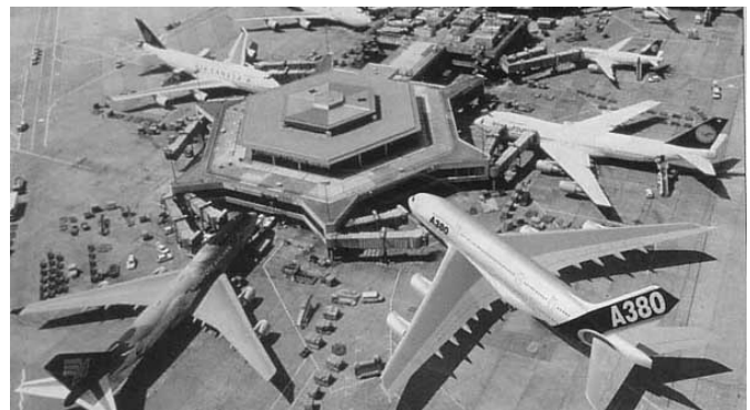
Figure 6 – An Airbus 380 (mock-up) at the gate. Note the relative size of the Boeing 747s [28].