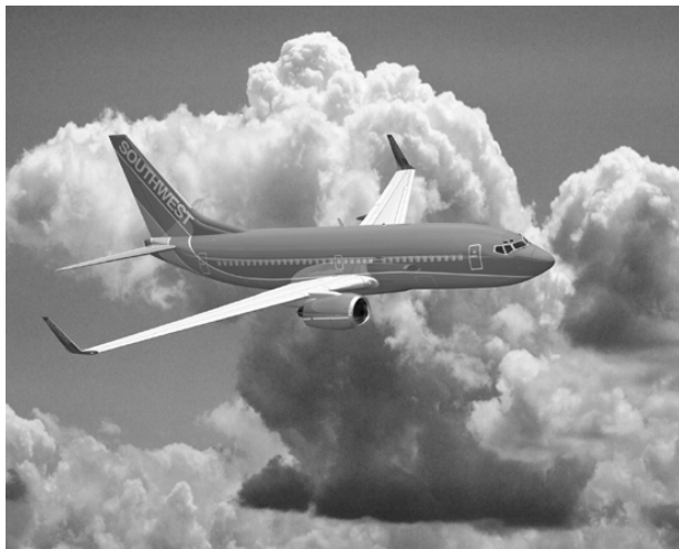
Figure 3 – A Boeing 737-700 jet showing the winglets, which provide increased range and improved climb performance [20].