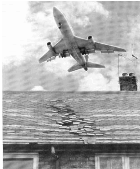
Figure 4 - Roof damage from airplane tip vortices [21].

Compressible flow is a senior-level course, an elective for mechanical engineers and required for aerospace engineers. The following applications are discussed in the lecture and explored further by the students through their research papers: