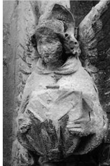
Figure 2 – A popular photograph showing the effects of acid rain on a statue, original source unknown [15].

These issues deal with increase of efficiency and/or the reduction of pollution during power generation.